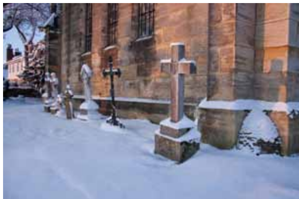
A cold spot for the former Vicars of Kilndown

Please phone Tunbridge Wells Borough Council 01892 554246 if you have any queries about waste collection and recycling.